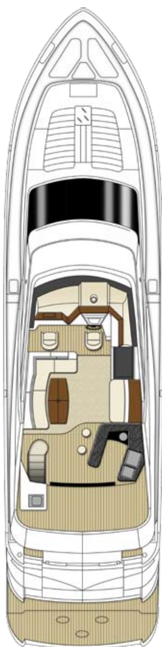
– Tri-Deck –