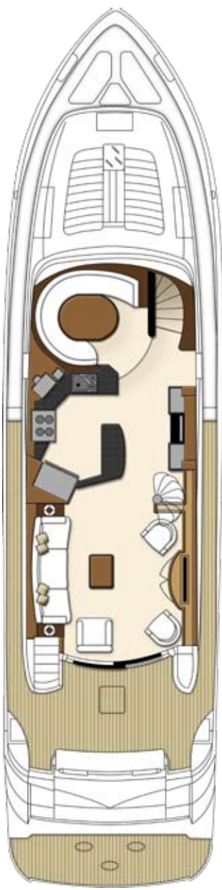
– Main Deck –