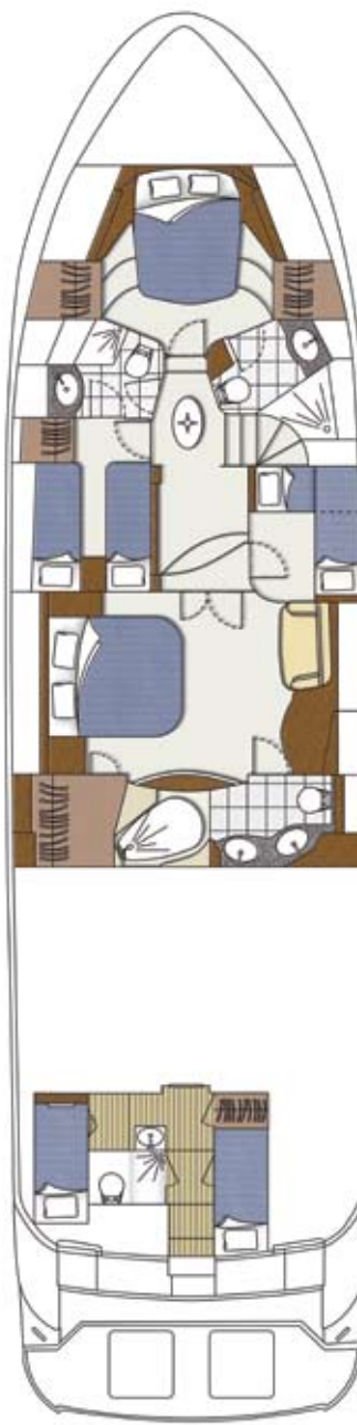
– Shown with optional Fourth Stateroom and Double Crew Quarters –