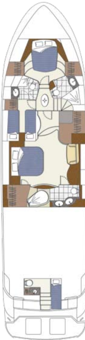
– Standard Layout shown with Crew Quarters Option –